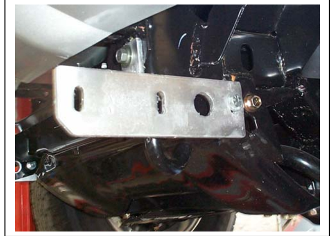
FIGURE 2 – Passenger side shown.