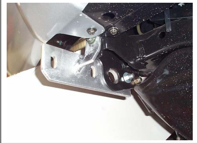
FIGURE 1 – Drivers side shown.